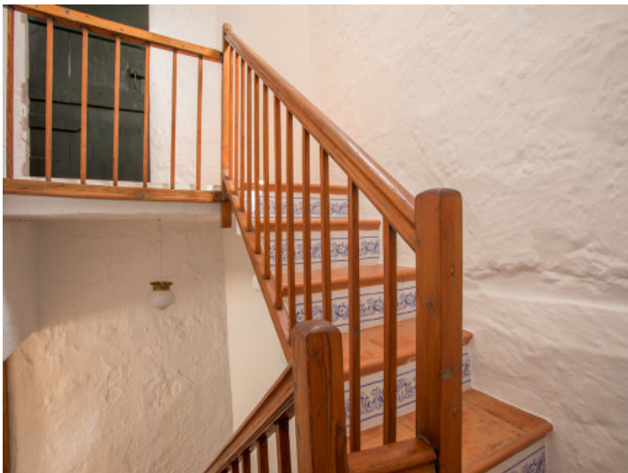
View of the floor