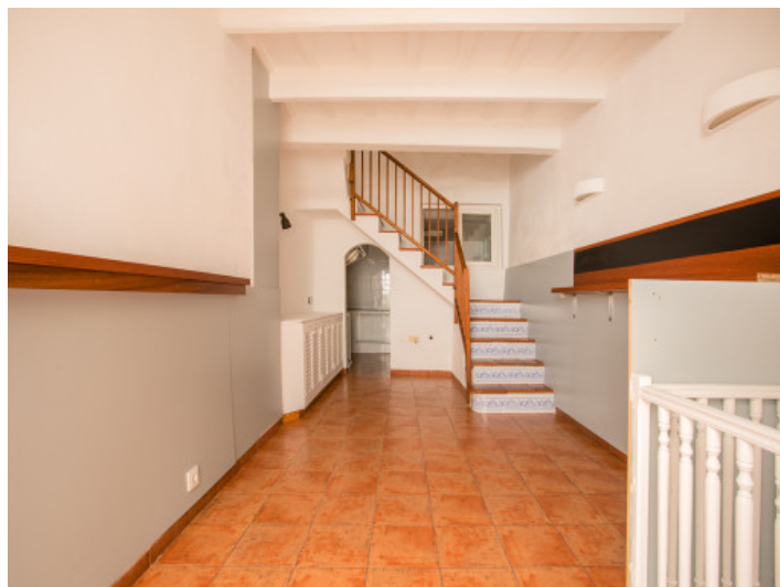
Open entrance area