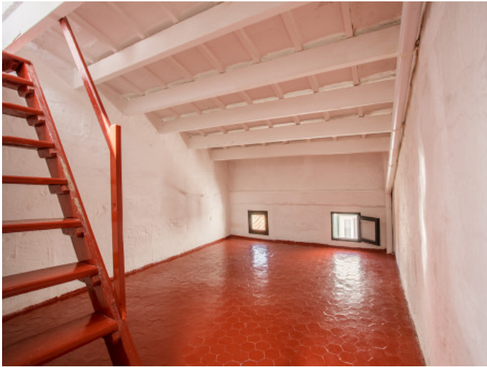
One of 6 rooms