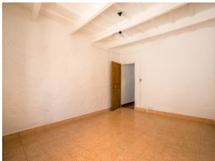
One of 6 rooms

All information is correct to the best of our knowledge. Errors and prior sale excepted. This prospectus is purely for information purposes. Only the notarized deed of sale is legally binding.