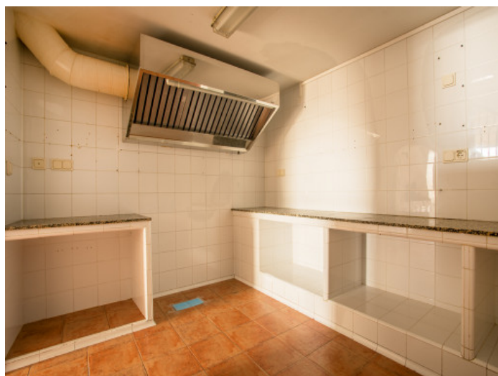
Rustic kitchen area